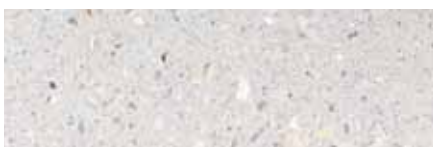
M3370 Ground Tudor® Finish