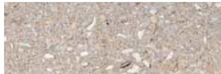
M3372 Ground Tudor® Finish