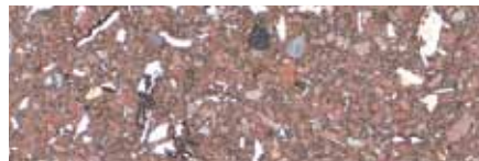
A80045 Ground Finish : 36.3%