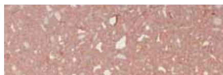
M3376 Ground Tudor® Finish