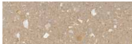
M3373 Ground Tudor® Finish