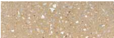
M2988 Ground Tudor® Finish