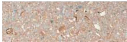
M3374 Ground Tudor® Finish

The colors shown are part of Hanover's Chesapeake Collection. Percentage of recycled content is based on the recycled materials used and varies for each color.