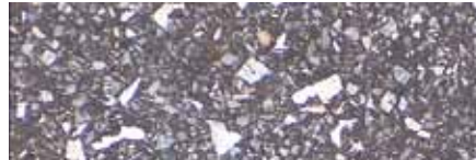
A80044 Ground Finish : 36.3%