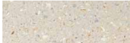
M3371 Ground Tudor® Finish

The addition of recycled clam shells boosts the recycled content of Hanover's Prest® Pavers, helping to earn LEED points and SS Credits.