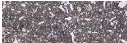
A80044 Ground Tudor® Finish : 36.3%