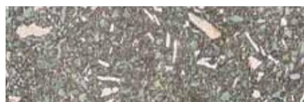
A80046 Ground Tudor® Finish : 36.3%