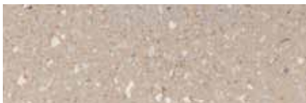
M3009 Ground Tudor® Finish

The colors shown are part of Hanover's Chesapeake Collection. Percentage of recycled content is based on the recycled materials used and varies for each color.