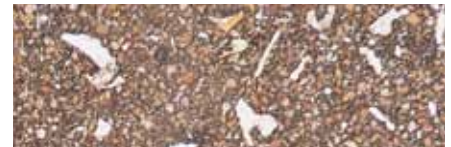
A80047 Ground Tudor® Finish : 36.3%

loop industrial cycle. By specifying Hanover® Asphalt Block, you support the recycling process.