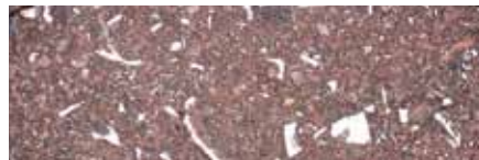
A80045 Ground Tudor® Finish : 36.3%