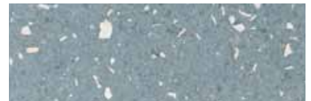
M3379 Ground Tudor® Finish