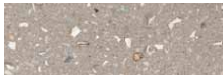
M3375 Ground Tudor® Finish