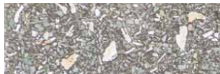
A80046 Ground Finish : 36.3%