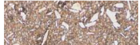
A80047 Ground Finish : 36.3%