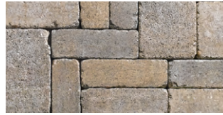
South Mountain Sand