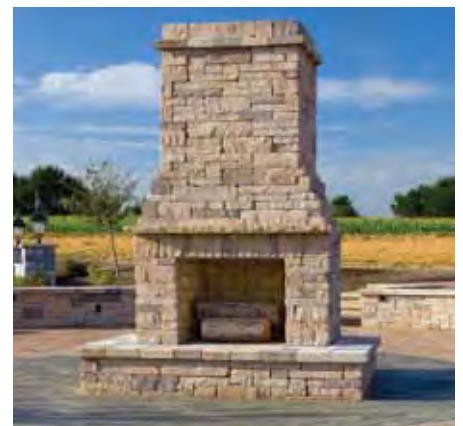
42" Outdoor Fireplace Kit