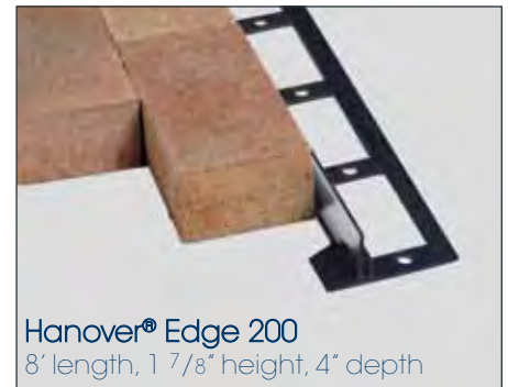
Hanover® Edge 200 8' length, 1 7/8" height, 4" depth