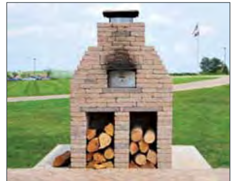
NEW Outdoor Oven

Hanover® can also provide the NEW FireRock Outdoor Oven. Made of the same proprietary insulating materials as our fireplaces, the wood fired outdoor oven can sustain temperatures of over 600°F and circulate heat for even cooking.