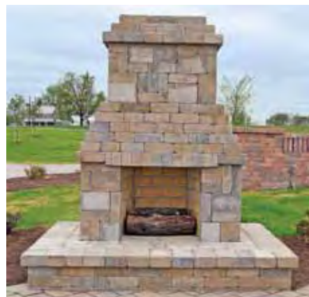
36" Outdoor Fireplace Kit