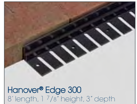
Hanover® Edge 300 8' length, 1 7/8" height, 3" depth