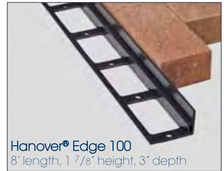
Hanover® Edge 100 8' length, 1 7/8" height, 3" depth

1 Spike = 13" length 1 Box = approx. 115 spikes = 50 lbs 1 Pallet = 48 boxes = 2400 lbs