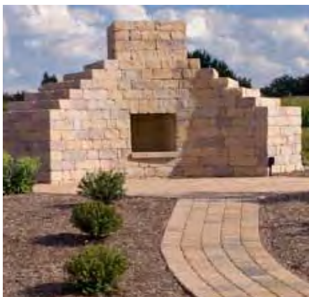
30" Outdoor Fireplace Kit